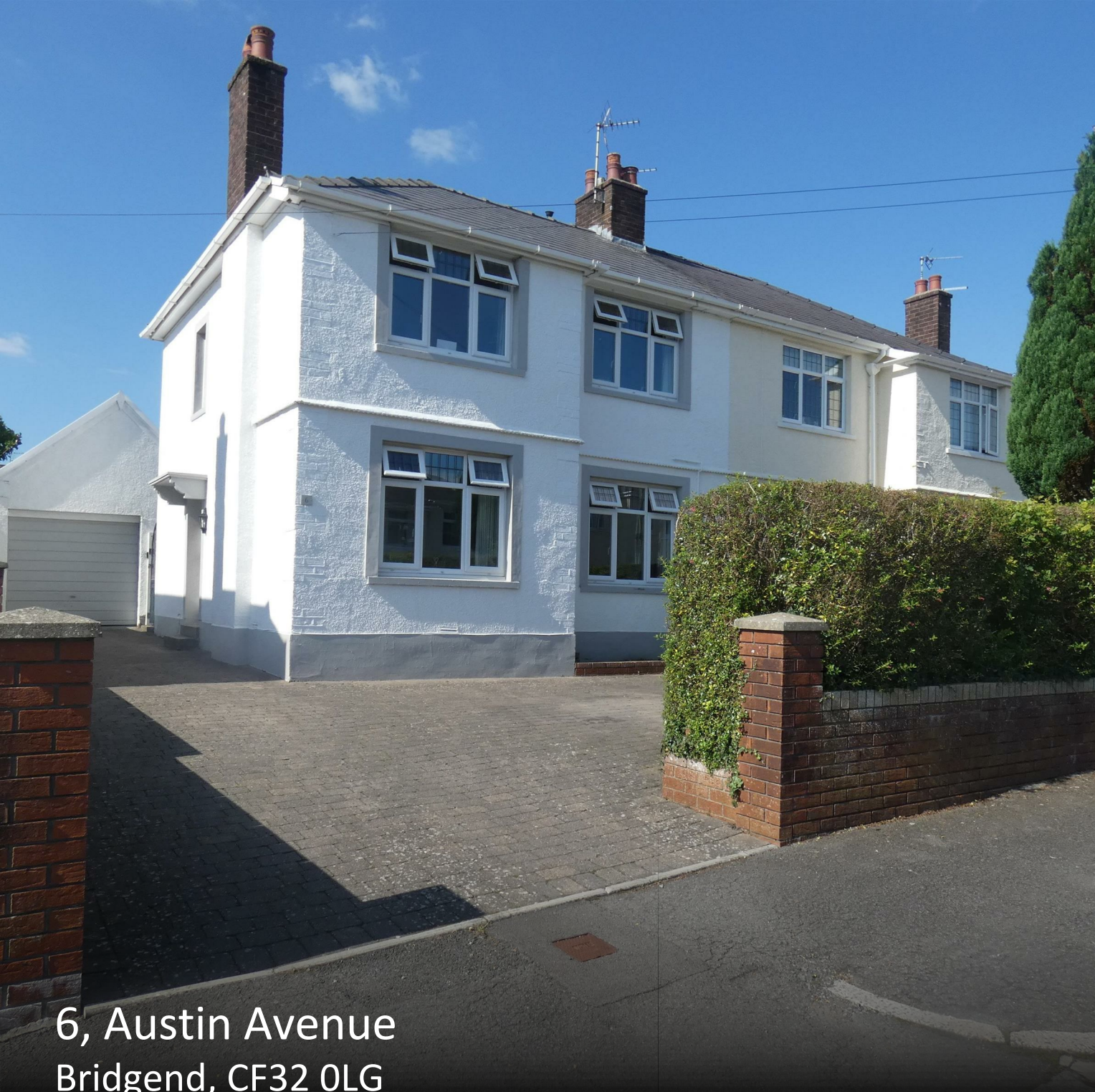
6, Austin Avenue Bridgend, CF32 0LG